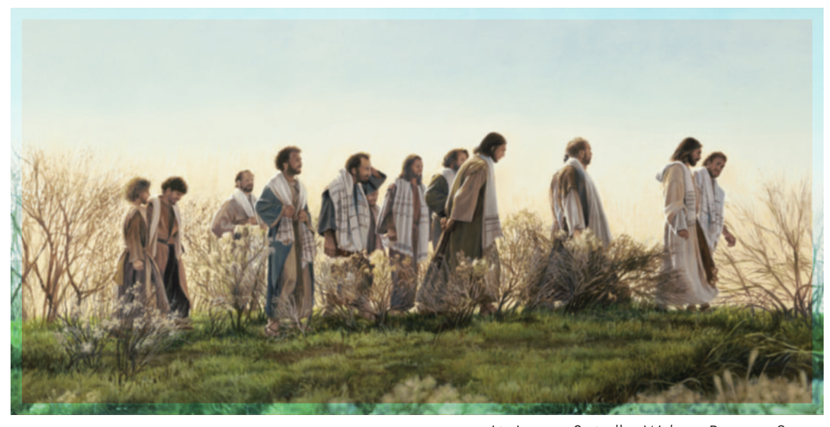
Liz Lemon Swindle, Without Purse or Scrip.