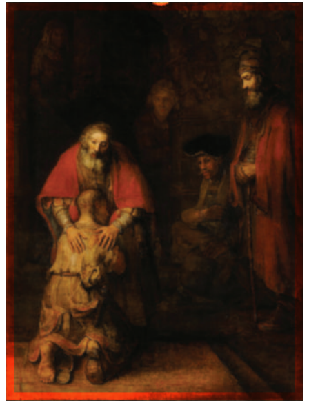
Rembrandt, The Return of the Prodigal Son.

What is the one thing you want to let go of in order to be truly happy?