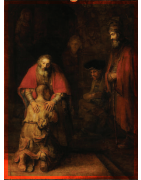
Rembrandt, The Return of the Prodigal Son .

After arresting Jesus they led him away. Peter was following at a distance. They lit a fire in the middle of the courtyard and sat around it, and Peter sat down with them. When a maid saw him seated in the light, she looked intently at him and said, "This man too was with Jesus." But Peter denied it saying, "Woman, I do not know him." A short while later someone else saw him and said, "You too are one of them"; but Peter answered, "My friend, I am not." About an hour later, still another insisted, "Assuredly, this man too was with him, for he also is a Galilean." But Peter said, "My friend, I do not know what you are talking about." Just as he was saying this, the cock crowed, and Jesus turned and looked at Peter. Peter went out and began to weep bitterly. (Lk 22:54-62)