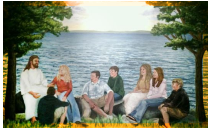
St. Raphael Parish - Oshkosh, I am Here.