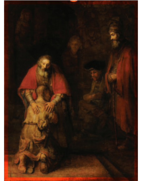
Rembrandt, The Return of the Prodigal Son .

What is the one thing you want to let go of in order to be truly happy?