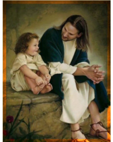
Liz Lemon Swindle, Friends .

When you think about love, what do you hunger most for?