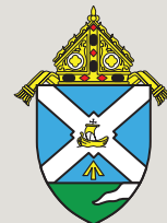
Diocese of Green Bay

All members of the public, Catholic and non-Catholic, are invited to Mass to join in prayer.