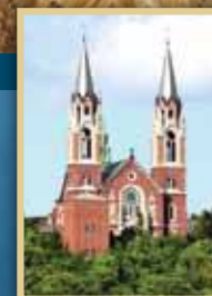
Shrine of Mary, Help of Christians