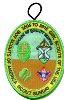
2015 Scout Sunday Patch

Patches are $3.00 each (includes shipping/handling) and can be ordered through the Education Department using this Order Form .