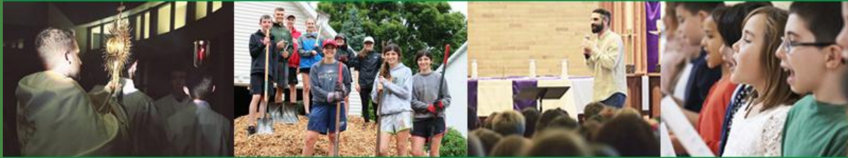
We are missionary disciples striving to lead all people to the Kingdom of God.