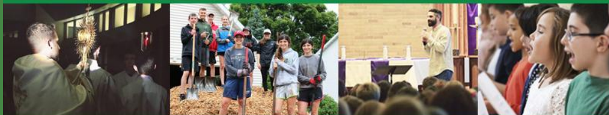
We are missionary disciples striving to lead all people to the Kingdom of God.